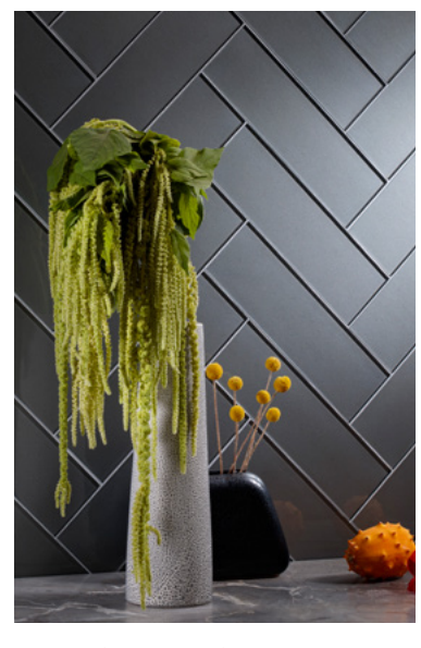
Celestial Glass in Dark Star