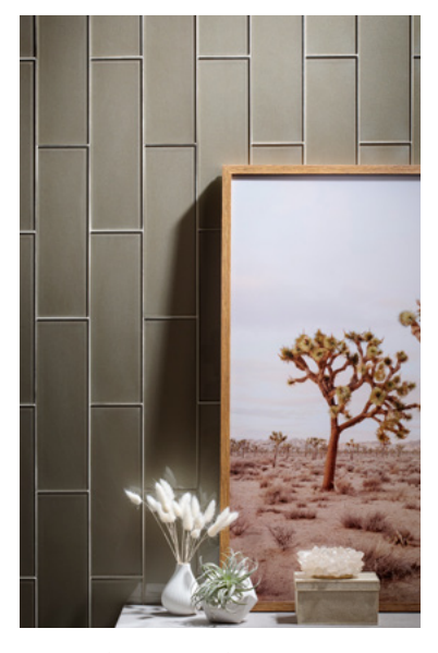
Celestial Glass in Dusk