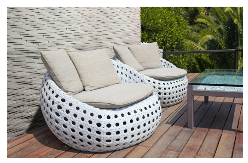
Rhythm Sandstone Grey in outdoor setting

apex, and lowest point of each slender tile strip. The elimination of rugged, angular joints at the apex of the original wedge design creates a softening effect for a soothing, more rhythmic overall appearance in the new design, while highlighting the natural appearance of stone.