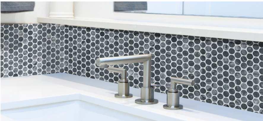
Nebula Stone Mosaics Penny Rounds

"Penny tiles have been trending strongly, so we are bringing out the classic penny round in our most popular and unique natural stone colors," said Island Stone CEO Nigel Eaton. "These stones offer a stunning blend of natural colors and in the penny round pattern the variation and natural character of the stone is accentuated beautifully." Stone Mosaics Penny Rounds are meshed-back mounted on 11-1/4"x12" sheets, making for easy installation. Suitable for most interior and exterior applications, both wall and floor, the Stone Mosaics Penny Rounds pattern is the perfect choice to elevate any space with its opulent look whether remodel or new build.